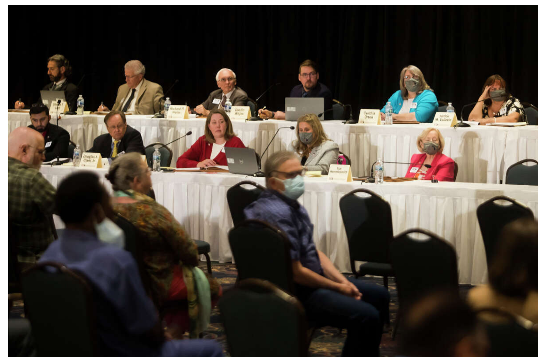
MICRC Members on Panel